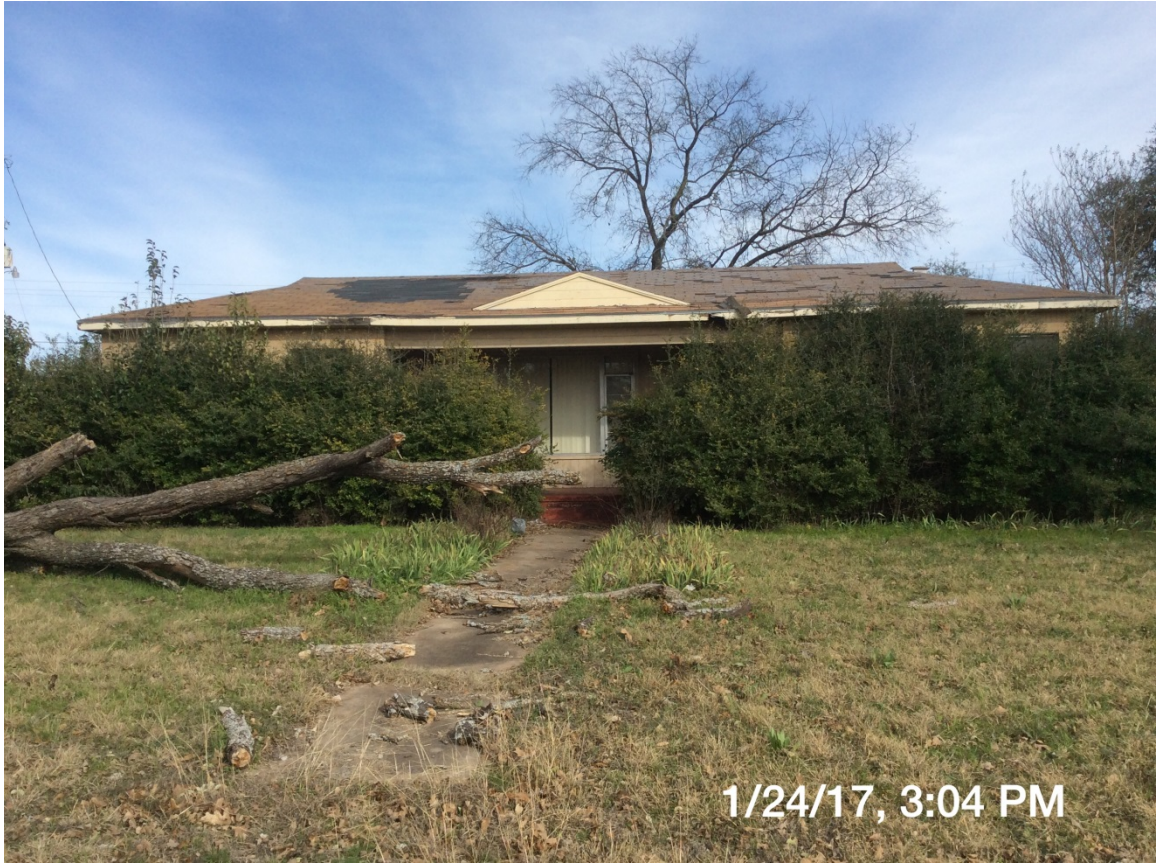
EXHIBIT A 1407 N. Water Street