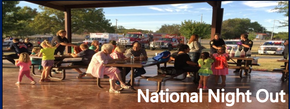
National Night Out