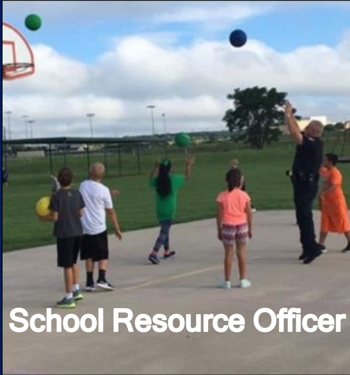
School Resource Officer