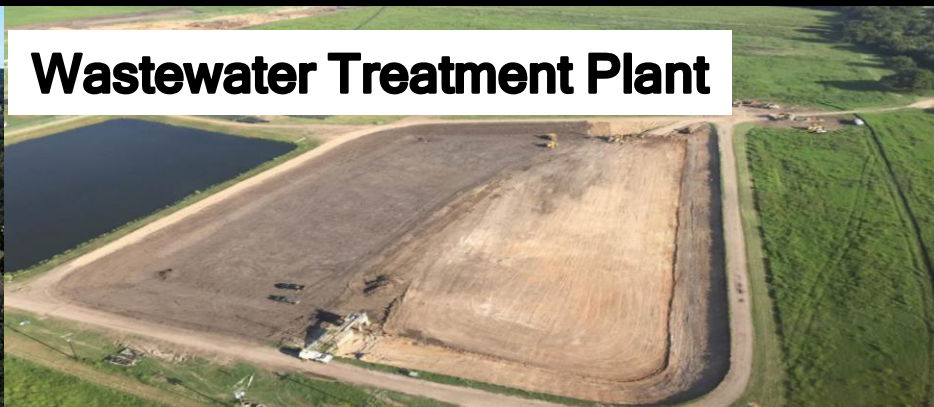
Wastewater Treatment Plant