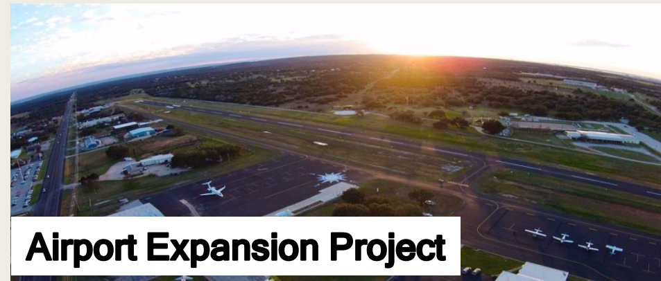
Airport Expansion Project