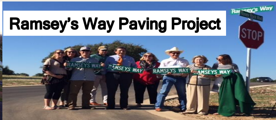
Ramsey's Way Paving Project