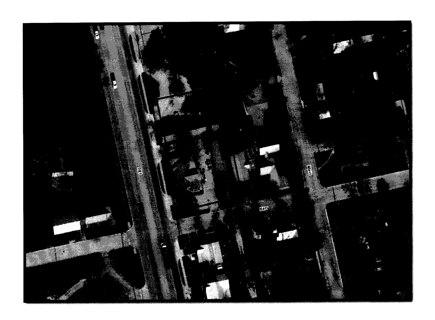
Exhibit "A" Location Map