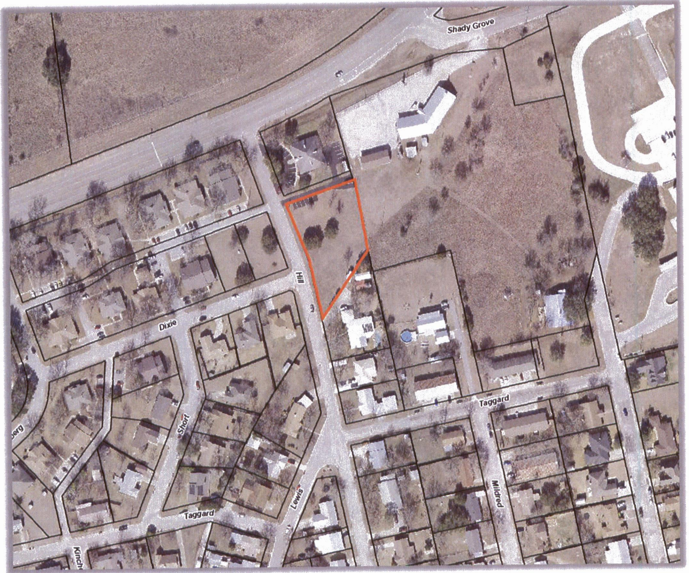
Exhibit "A" Location Map