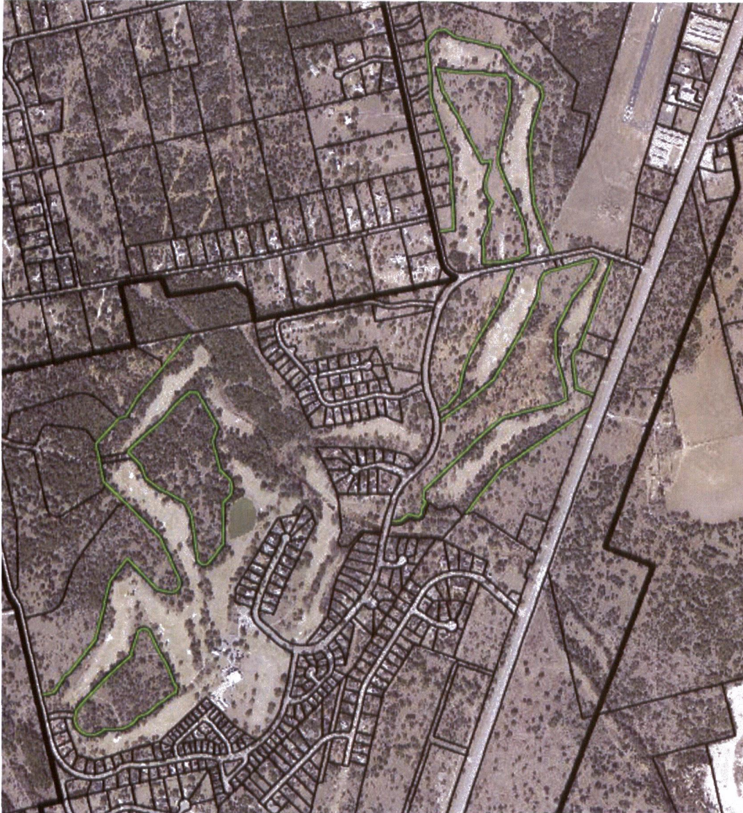
Map 118-63 – Boundary Agreement Tracts 1, 7, 14, 15, 16, 17, 21, 22, 23, 24, 25, 26 and 27 boarders outlined in green