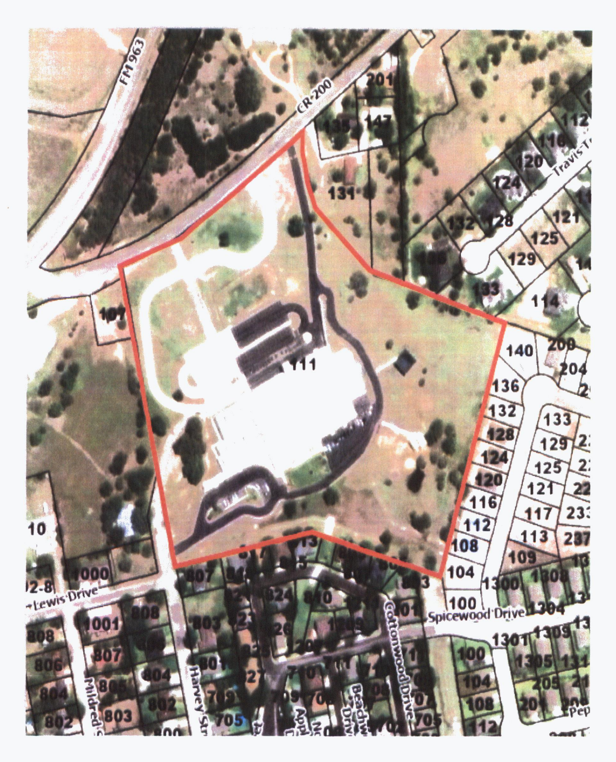
Exhibit "A" 111 SHADY GROVE RD, SHADY GROVE ELEMENTARY SCHOOL (LEGALLY DESCRIBED AS: ABS A0405 JOHN HAMILTON, TRACT PT OF 308, 20 ACRES)