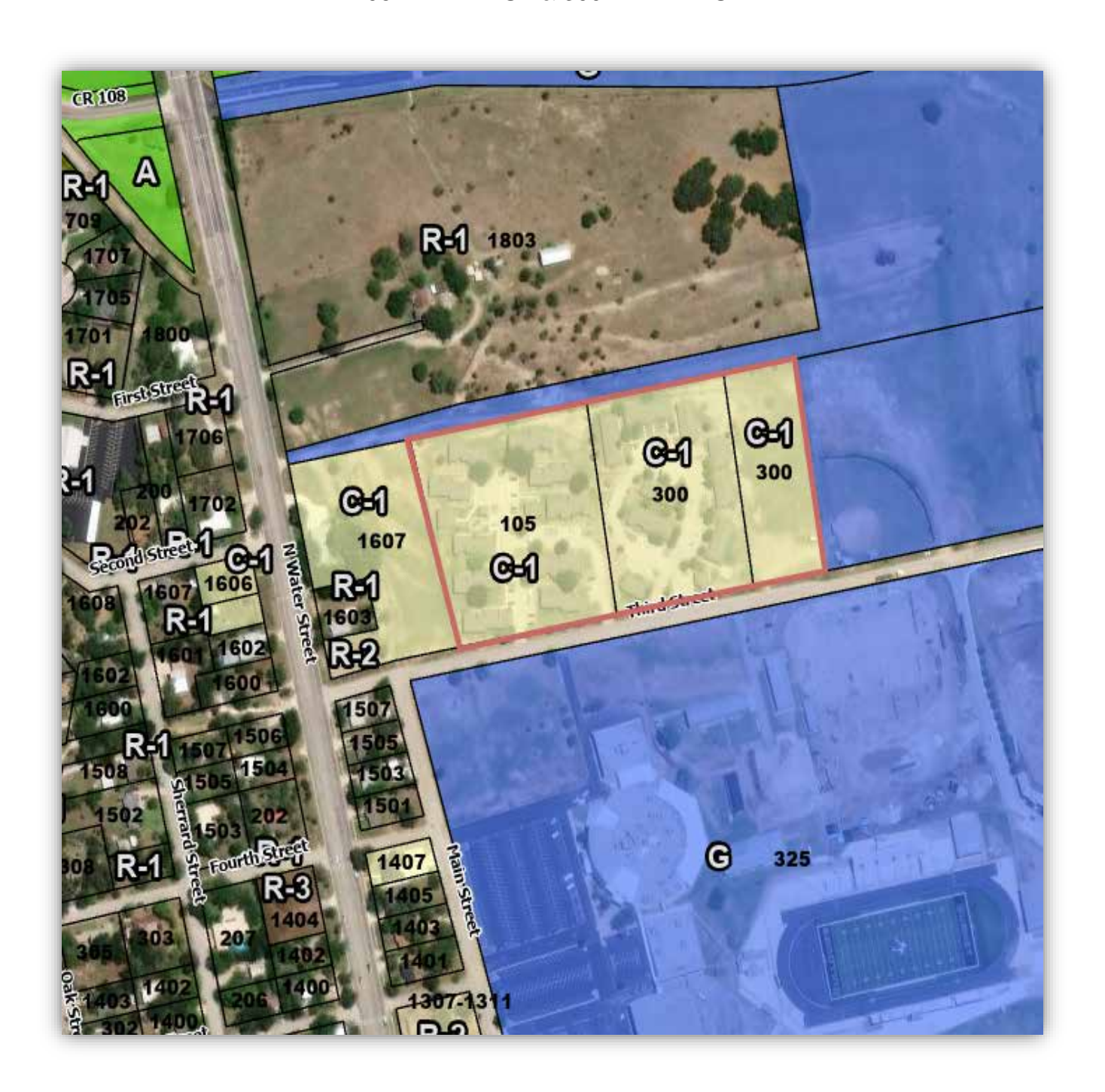
Exhibit A – Location and Current Zoning 105 E THIRD ST & 300 E THIRD ST