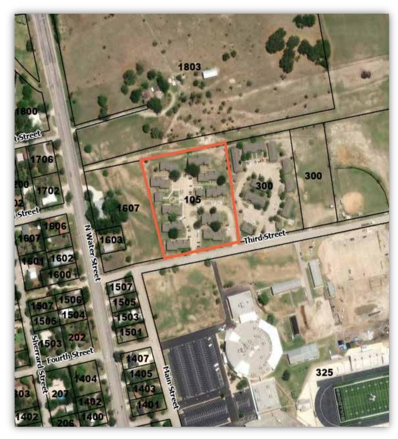
Exhibit "A" 105 E THIRD STREET (LEGALLY DESCRIBED AS: BEING 4.307 ACRES OUT OF THE JOHN HAMILTON SURVEY NO. 1, ABS. NO 405)